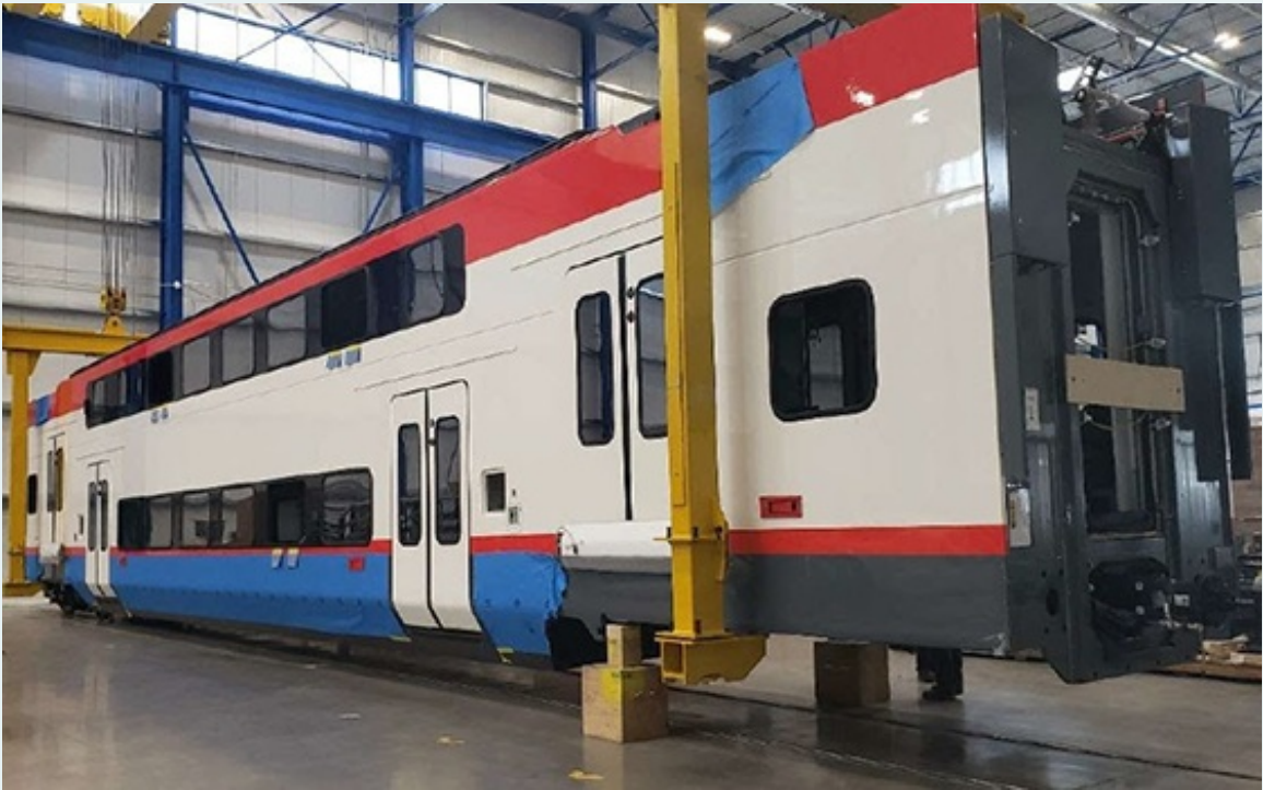
Lifting or lowering one end of the car simulates a vertical curve at the opposite track.

Ever wonder how manufacturers ensure trains can safely make turns? They conduct what's called a "Swing Test." This includes adding weight to the vehicle to simulate passengers then lifting, lowering, and swinging the ends of the car to simulate curves. The test verifies proper clearances between car body, trucks, couplers, and associated wiring and air piping during both vertical (hills and valleys) and horizontal (turns) track curves. Check out the photos here for a behind-the-scenes look into how these tests are being performed on our new trains.